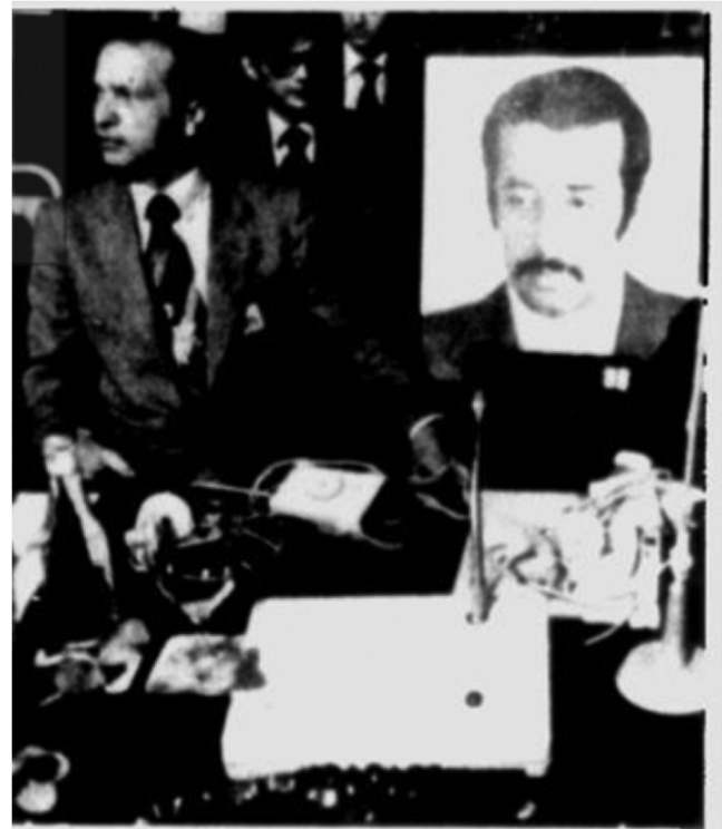
Picture 1. Illustration of OPEC's resilience: The Iranian deputy minister of petroleum, left, sits next to a portrait of the nation's oil minister who was captured by Iraqi troops. The photo was placed on an empty chair during the OPEC meeting of 1980.

Finally, OPEC will not wither away quickly because it still proves useful for its member countries, as is most vividly illustrated by the